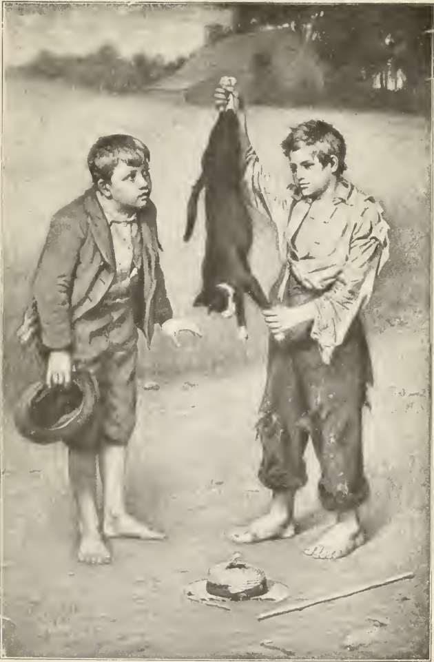
“ ‘ LEMME SEE HIM, HUCK ’ ”